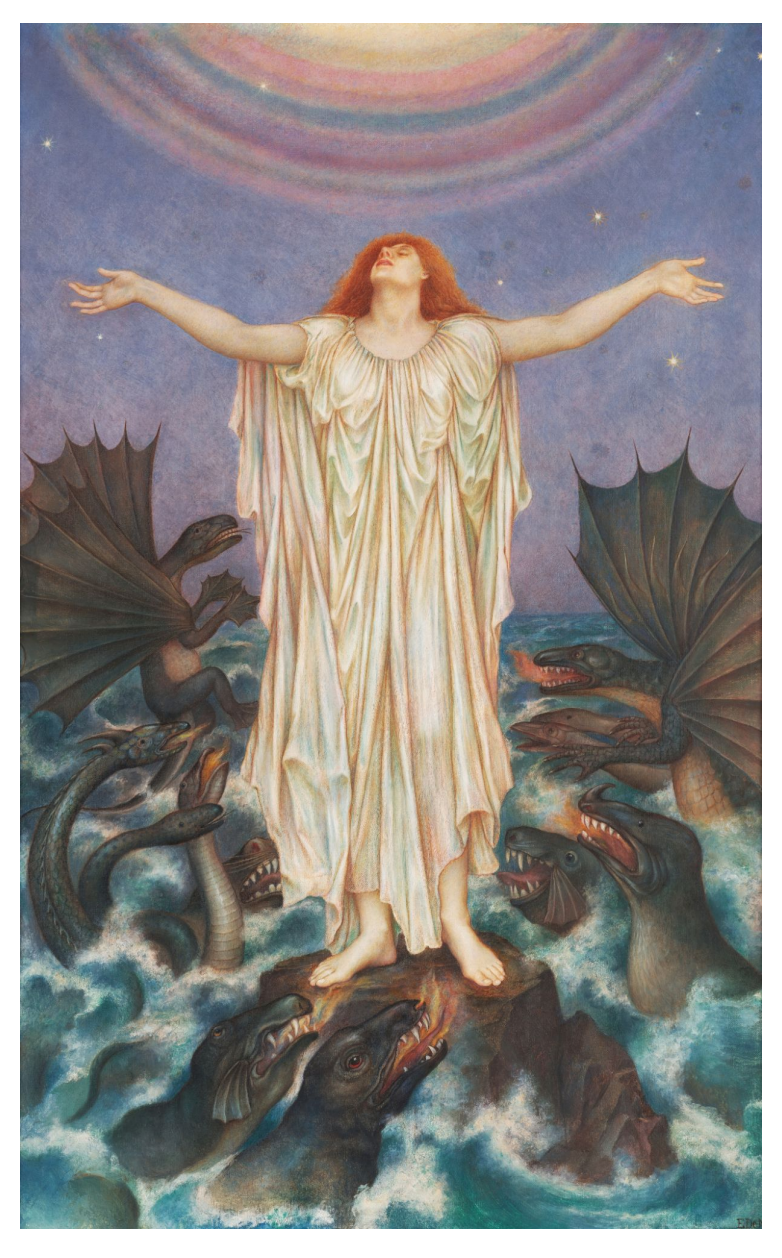
Figure 2: Evelyn De Morgan, S.O.S. , 1914–16, oil on canvas, 93.4×65.5cm.

which would presumably allow a wider range of colours again to be discerned in the rainbow.<sup>29</sup>